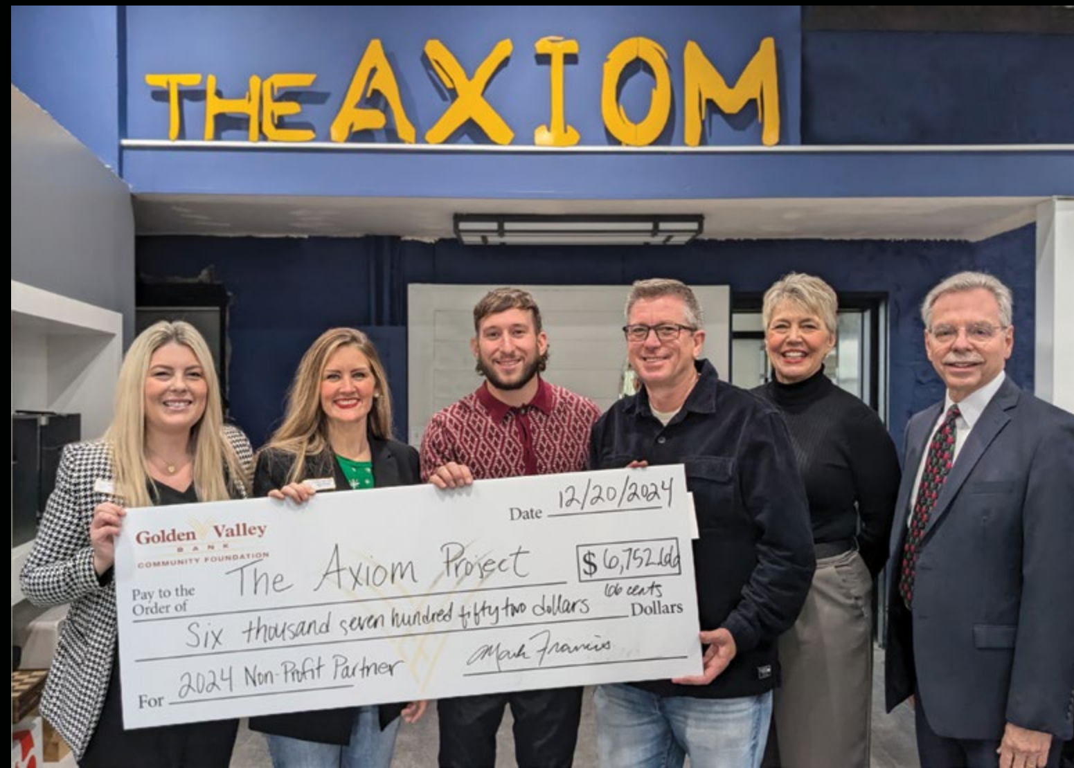
In 2024 our Oroville team raised money for The Axiom. With matching funds from our Golden Valley Bank Community Foundation, we presented them with a check for $6,752.66.

Our commitment to community service goes beyond sponsorship. The employees of Golden Valley Bank are encouraged to volunteer and actively participate in community projects. We believe that a community thrives when its members support each other. We are proud to be a part of Oroville's journey and are dedicated to continuing our efforts to create a bright future for everyone.